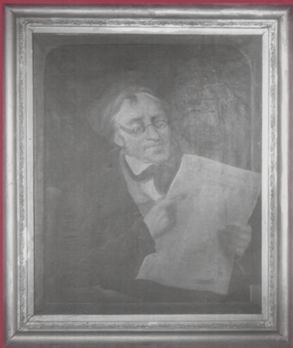
Painting: Man reading Limerick Reporter of 18 October; 1844 Artist Unknown