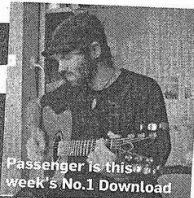
Passenger is this week's No.1 Download