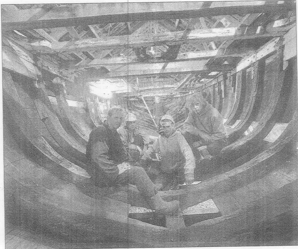
Learning the craft: Students learning the art of boat building at the Ilen school in Roxboro

The Gandelow Races - a rowing contest along the River Shannon in Limerick City - will be a chance for