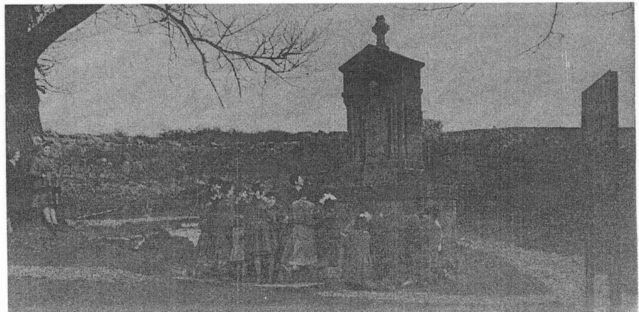
A 1958 picture of St. Patrick's Well with local children saying a prayer on St. Patrick's Day