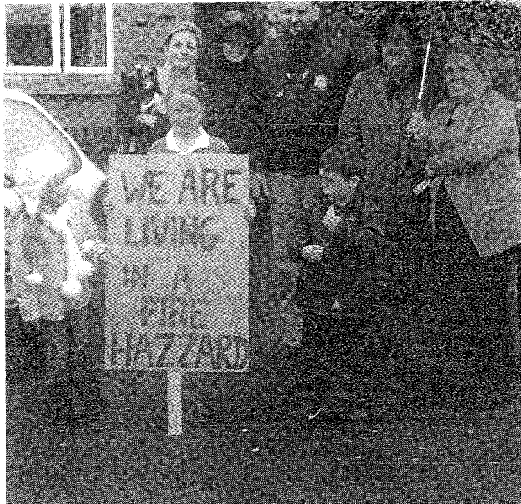
Residents from the Parkview Apartment complex, on the Kileely Road, fear they are "living in a fire hazard".

Clr Kiely has urged fire safety chiefs to carry out an inspection of