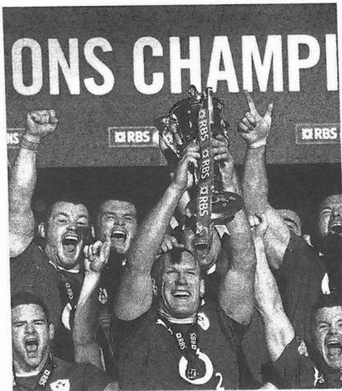
Happy days: Paul O'Connell lifts the Six Nations trophy after the 2014 competition