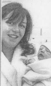
First 2006 baby boy born in Limerick

PAGE 64 O'Malley persists in bursting boundary bubble