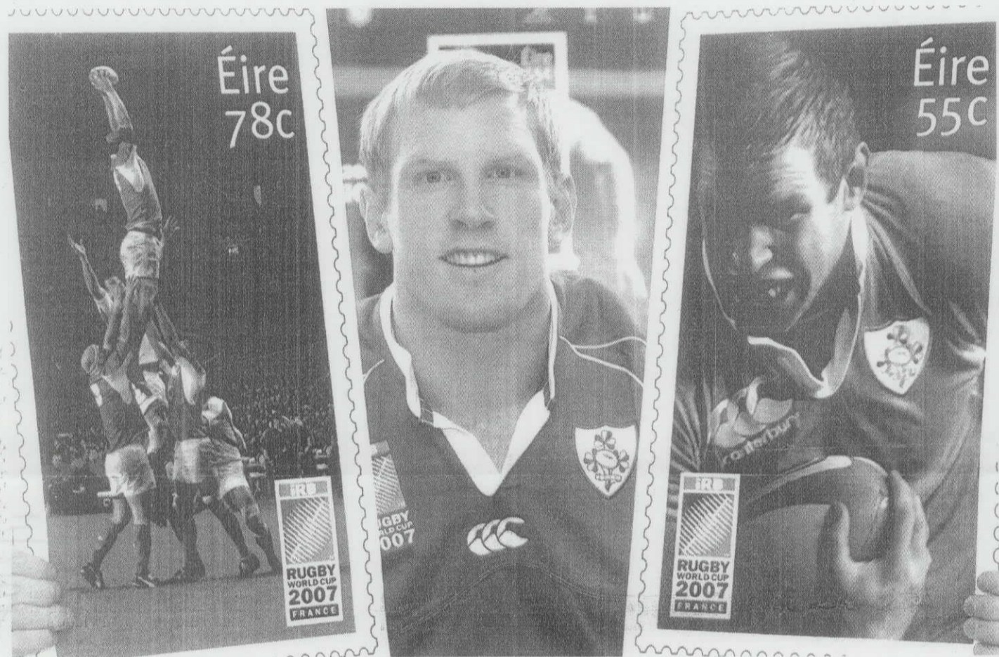
Munster and Ireland rugby star Paul O'Connell at the launch in Dublin, of the new stamps which feature himself as well as his Ireland team mates