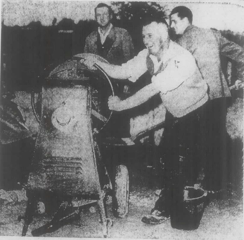
(right) gives a helping hand to the Young Munster men at the erection of the new pavilion at the Young Munster Grounds at Rosbrien.