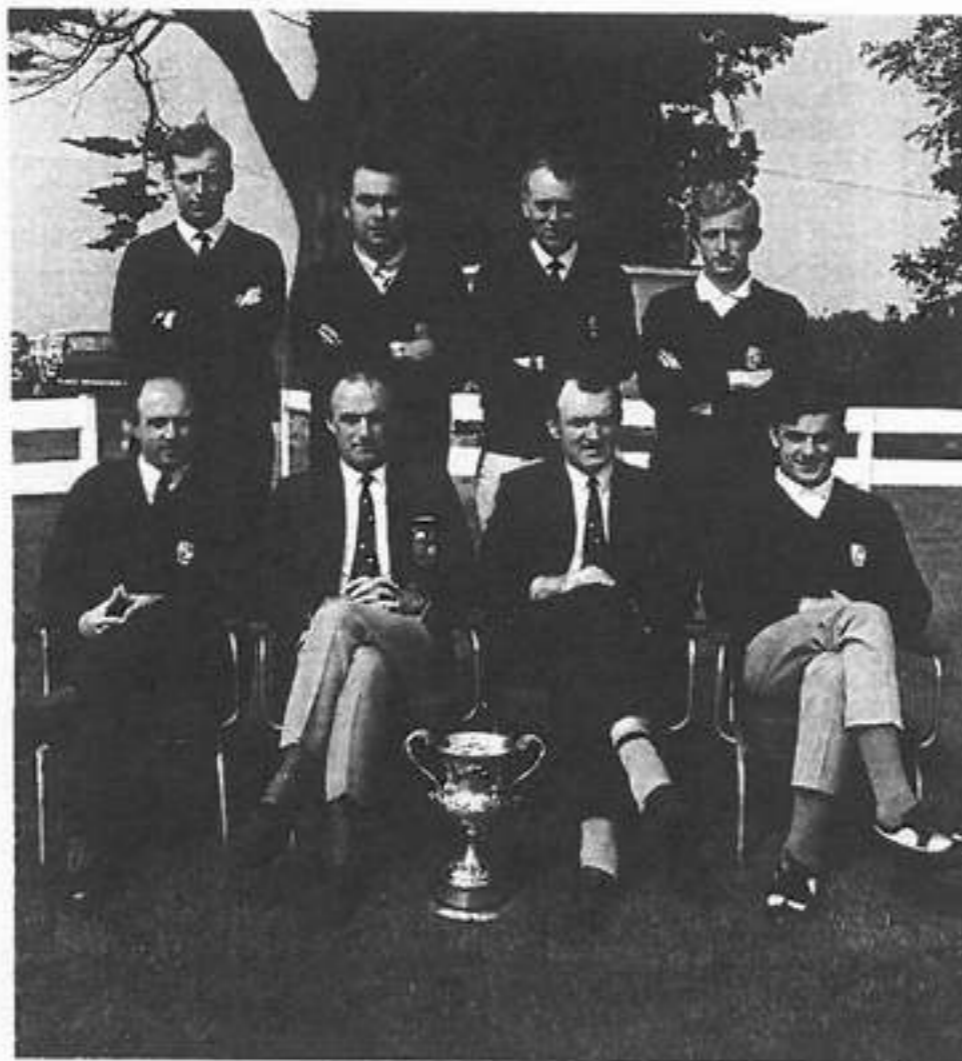
Club steeped in history: The Limerick Golf Club Seniors group pictured in 1970

The JP McManus Invitational Pro-Am, the biggest pro-am event of its kind in Europe, had its home at Limerick Golf Club from 1990, with the last staging in July 2000. The field included some of the biggest players in the game,