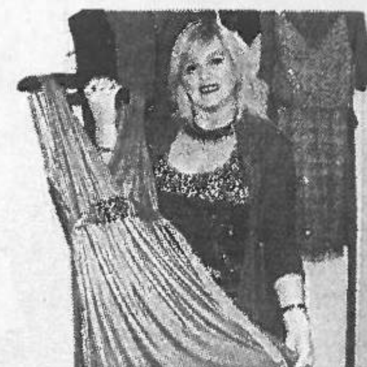
SEE PAGE 3