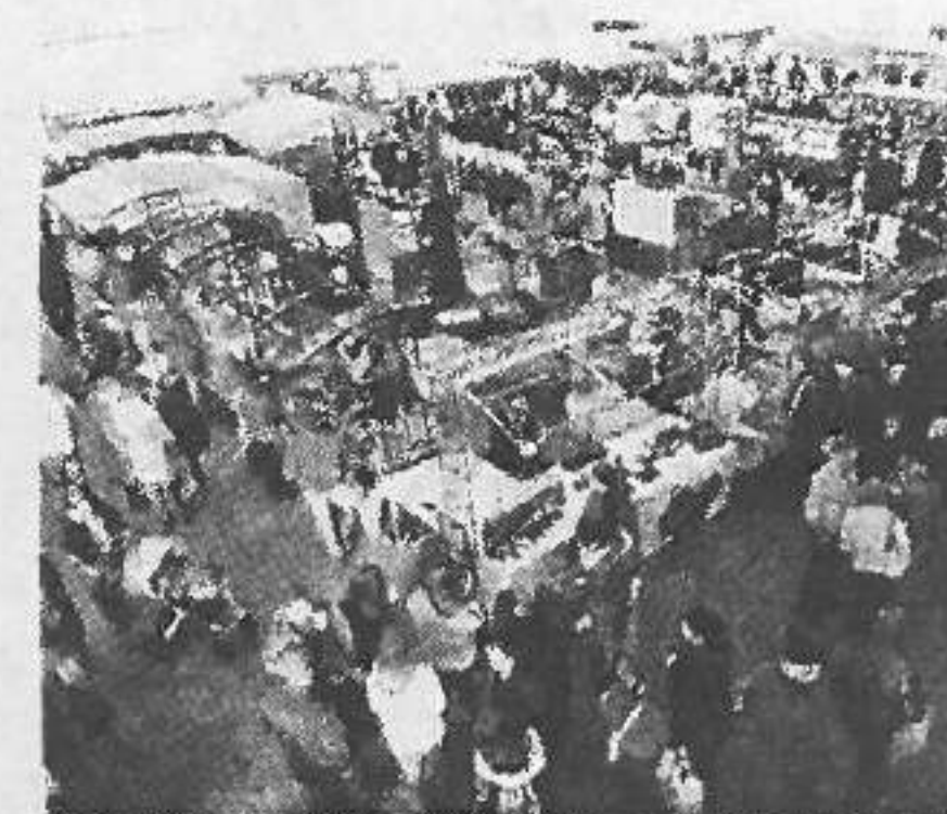
SEE PAGE 4

NE FITZGERALD zgerald@limerickleader.ie @nefitzgerald2