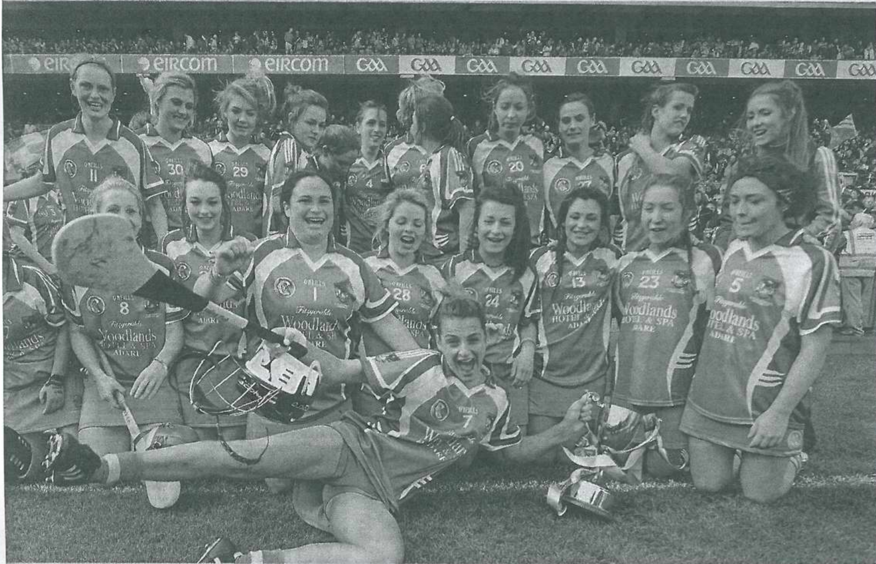
Champions: the Limerick camogie team celebrate their All Ireland final win in Croke Park yesterday