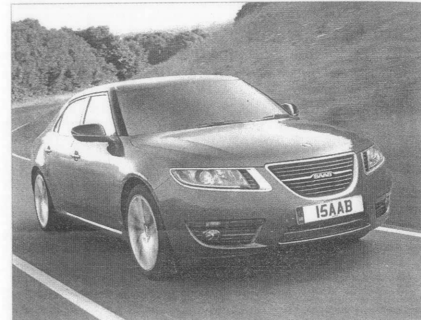
The new Saab 9-5 saloon, first off the line following Spyker Cars' rescue of Saab from a proposed shut-down by General Motors.

THE production lines at Saab's Trollhättan factory in Sweden plant began rolling again this week following the rescue by Spyker Cars from a proposed General Motors closure of the business.