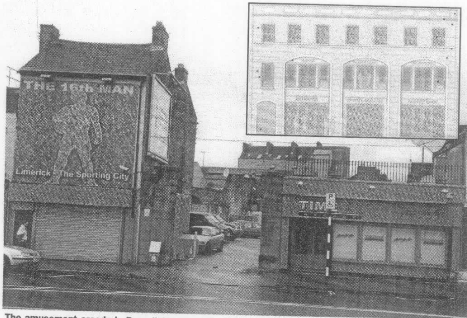
The amusement arcade in Parnell Street where it is proposed to construct a new building and which will house a sports museum (pictured inset).

It has been suggested that the proposed venture at Parnell Street could accommodate Johnny's vast collection.