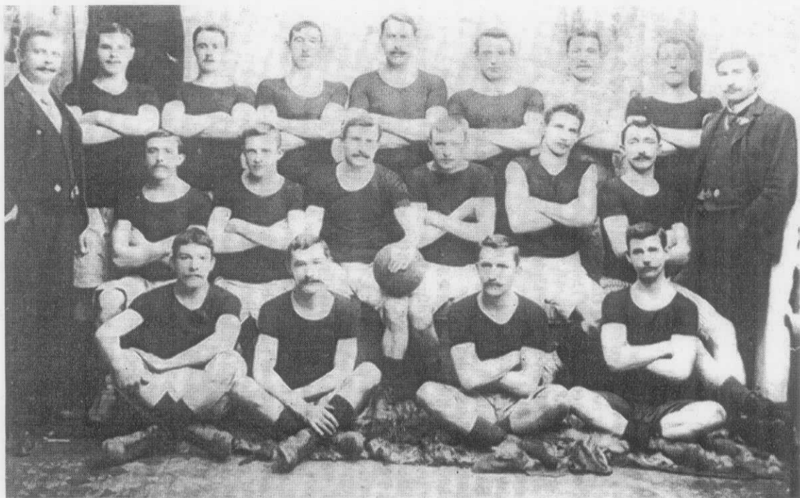
Commercials - the 1896 Munster senior football champions