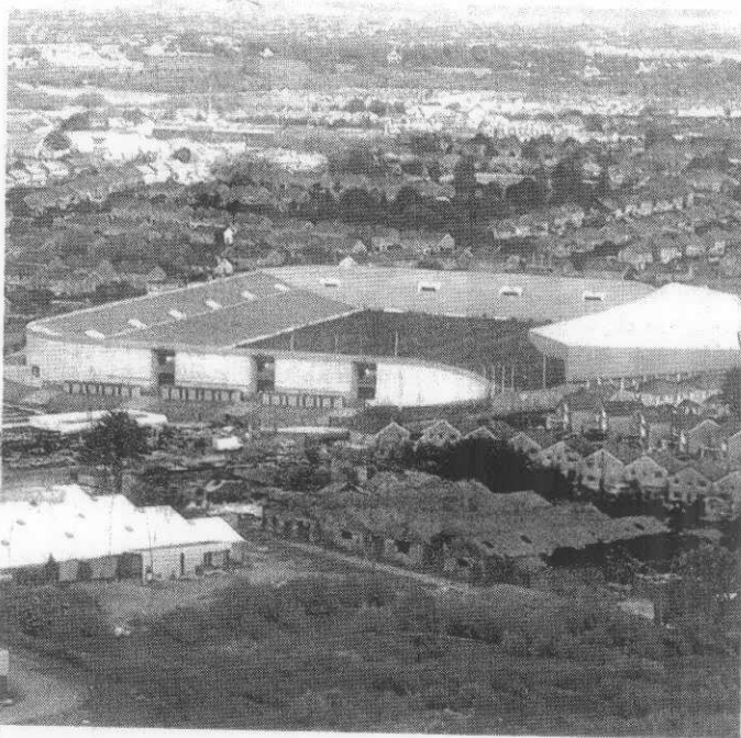
The Gaelic Ground is to play host to the first Test in this year's International Rules series, at which the new floodlights of the Ennis Road venue will be switched on for the first time