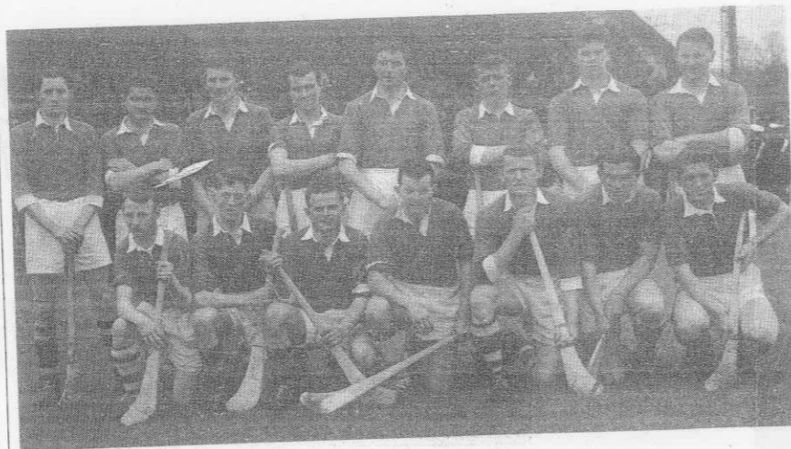
The team The Limerick team who played Wexford in the game at the Gaelic Grounds. Wexford were the then powerhouse in hurling at the time