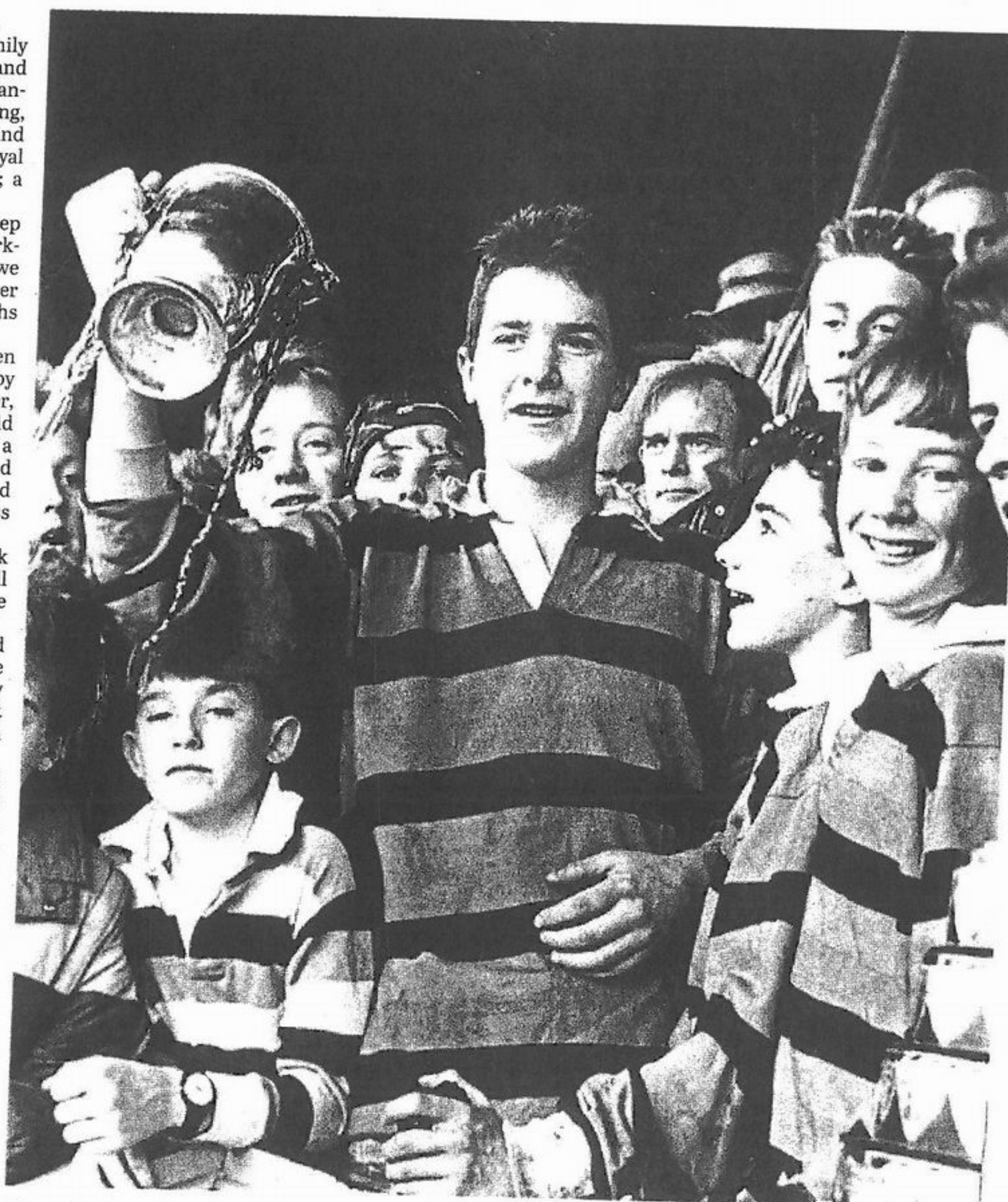
The early days: Anthony Foley after winning the Munster Schools Junior Cup with St Munchin's in 1989

The funeral will take place at midday on Friday in St Flannan's Church, with the church reserved for family and friends. He will lie in repose on Thursday night from 1pm to 8.30pm, with people intending on paying their respects asked to attend early. The house afterwards is private. Burial afterwards will be at Relig Nua Cemetery, Killaloe.