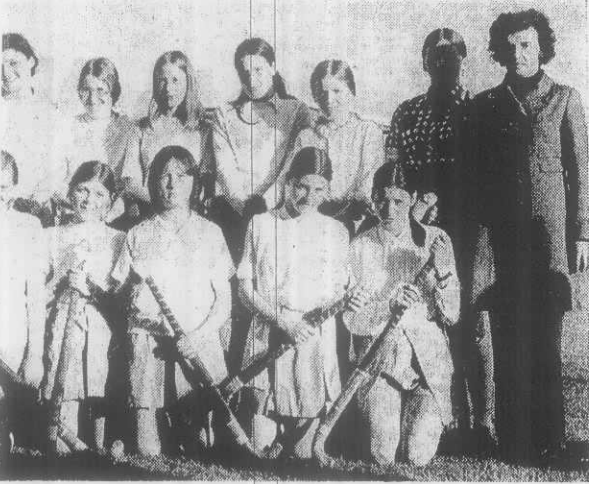
Lourdes Hockey team who were beaten in the under 16 final of the games against Garryowen. The match was played at the Catholic Institute grounds.