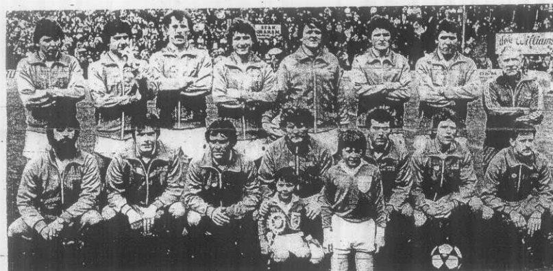
The Limerick team that won the F.A.I. Cup by beating Bohemians 1-0 at Dalymount Park on Sunday.