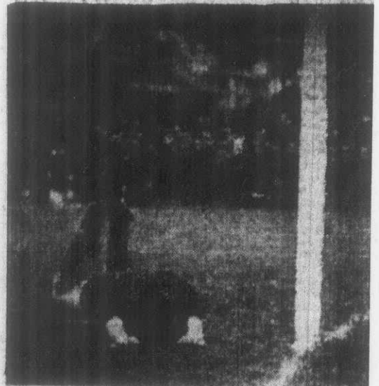
No. 1—Dillon's shot