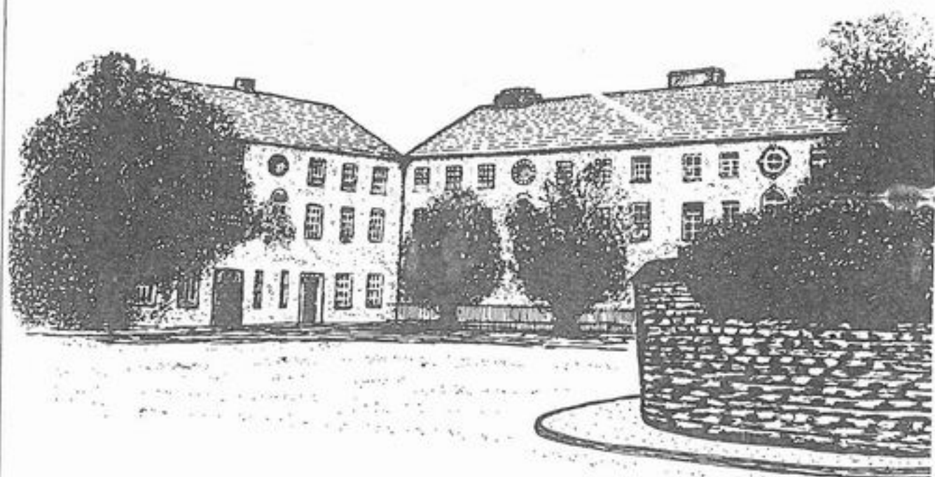
St. John's Square, built in 1751.

No. 5 South, which was also close to other dwellings at Chapel Lane (now Canter's Range). Furthermore, it was unlikely that a dye works and a brewery could be accommodated in the same backyard.