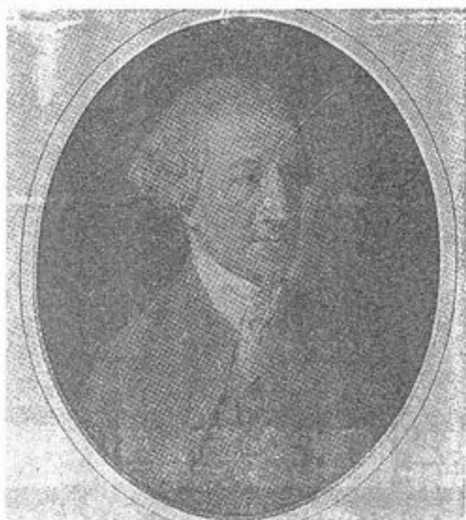
A 1790s pastel portrait of Edmond Sexton Pery, by Hugh Douglas Hamilton.

Glentworth Street, Mallow Street, and Cecil Street — surely a record for any town or city in Ireland.