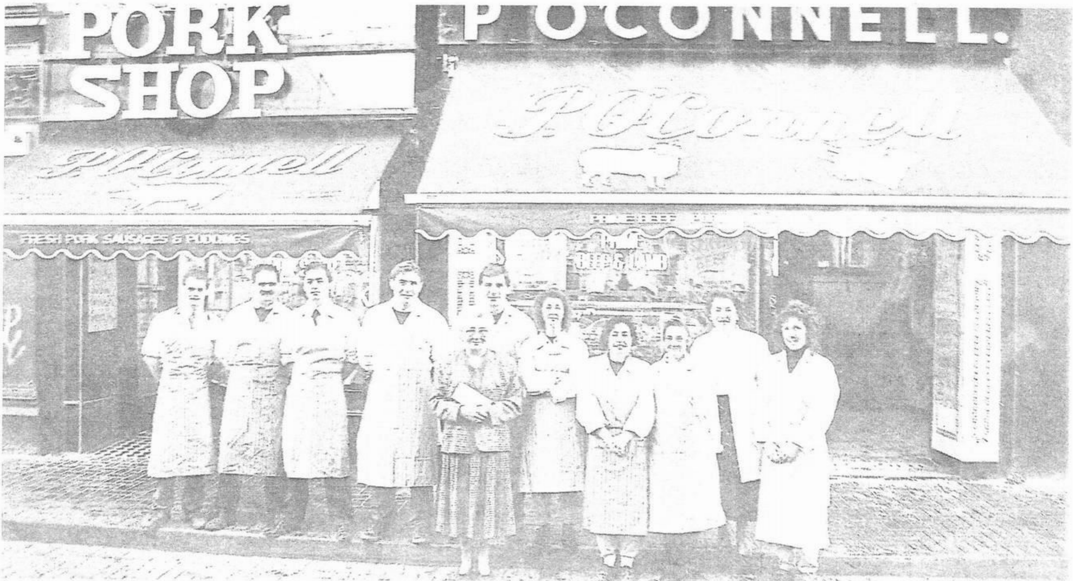
Staff of O'Connell's Butchers, Little Catherine Street pictured in 1992. The family butchers are still going strong and recently won another international award for its quality produce