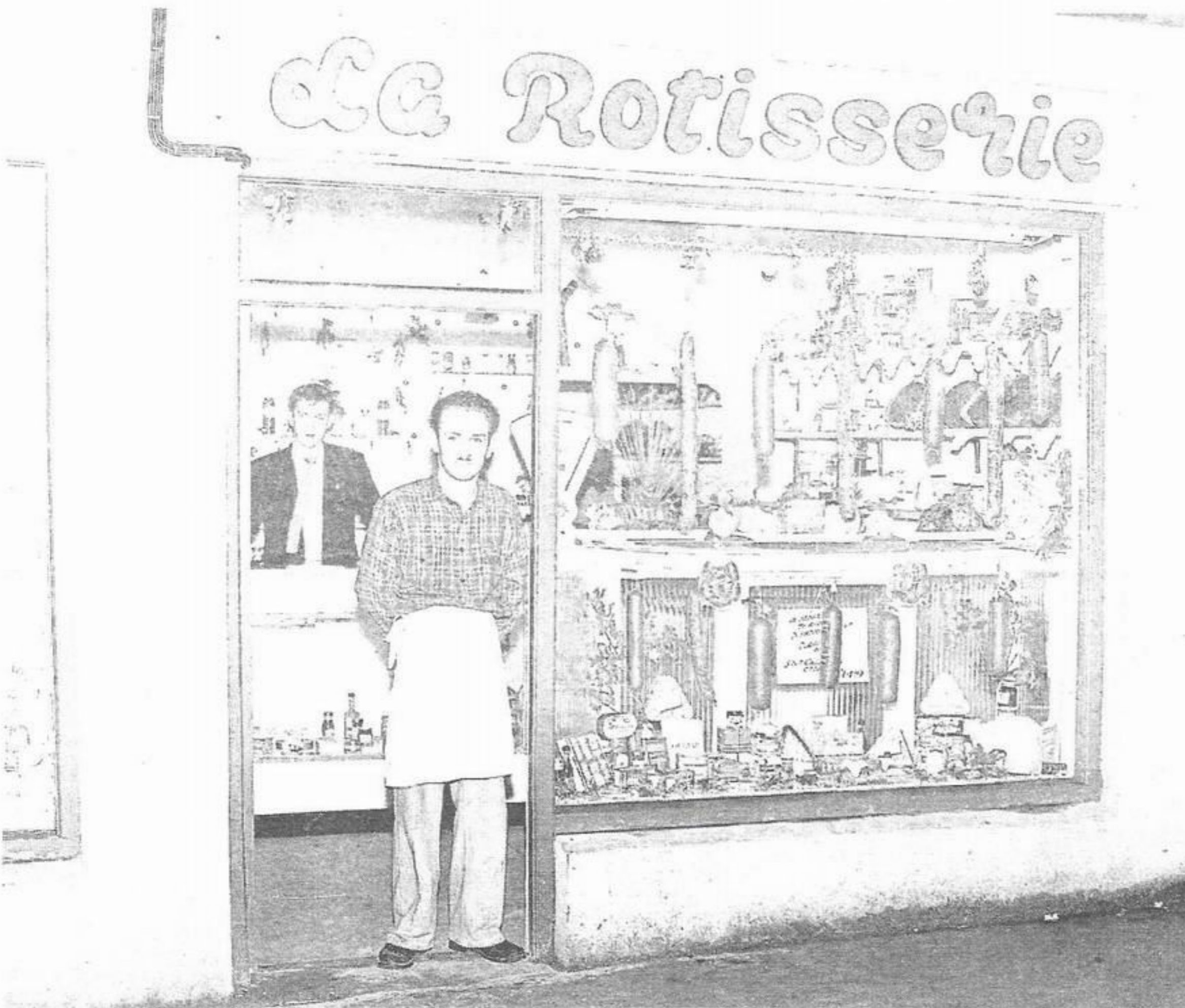
La Rotisserie delicatessen on Cecil Street pictured in December 1956