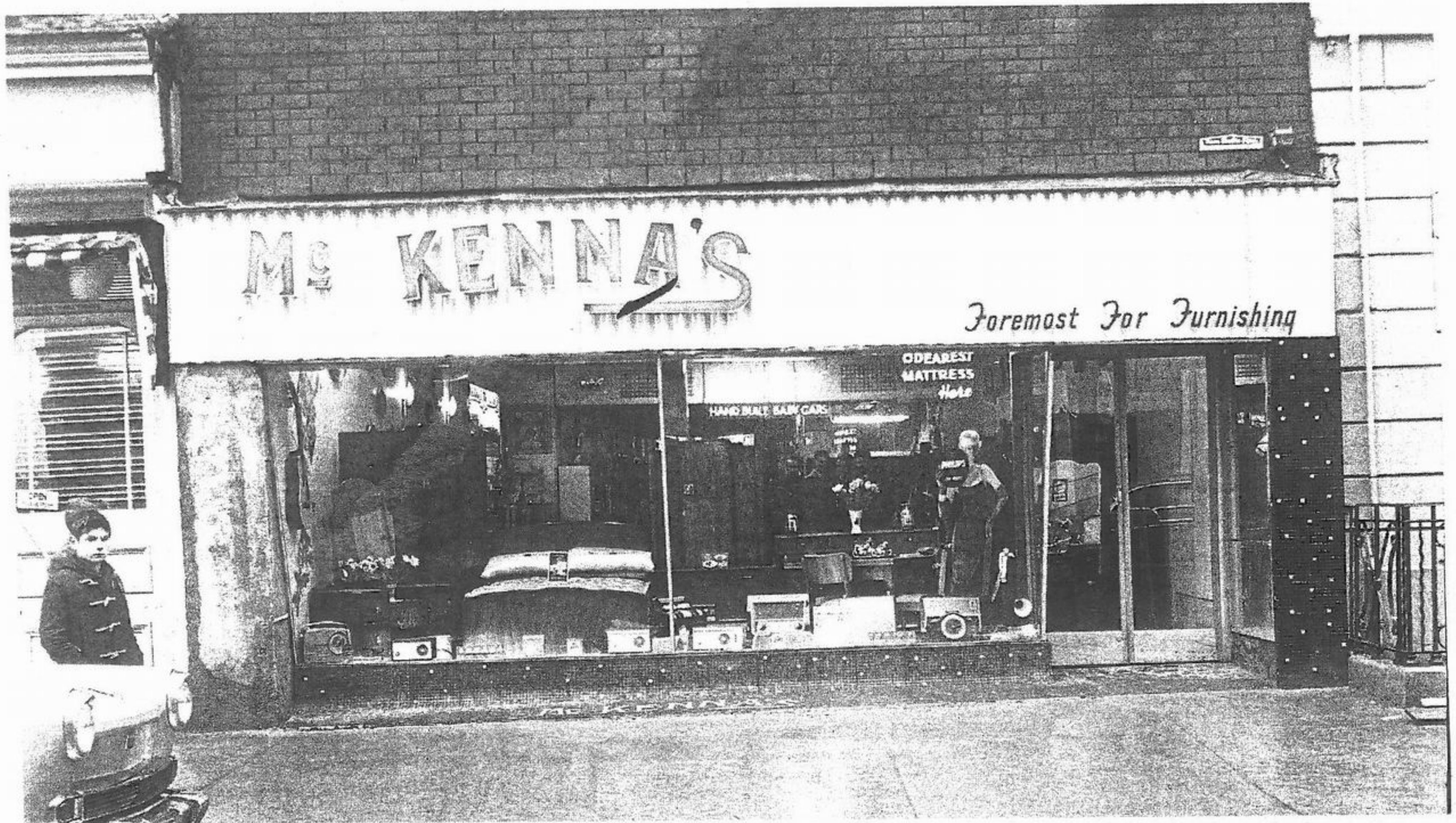
This picture of McKenna's furnishing store, 4 O'Connell Street, was taken in 1959 to show of its new facade. Throughout that year, the company gave away raffle tickets every Friday. They held a Friday Exhibition and each visitor would receive their free ticket and be entered into a draw to win a portable radio worth over twenty-one pounds. The radio a Model PJ508 sits in a cabinet veneered in French Walnut