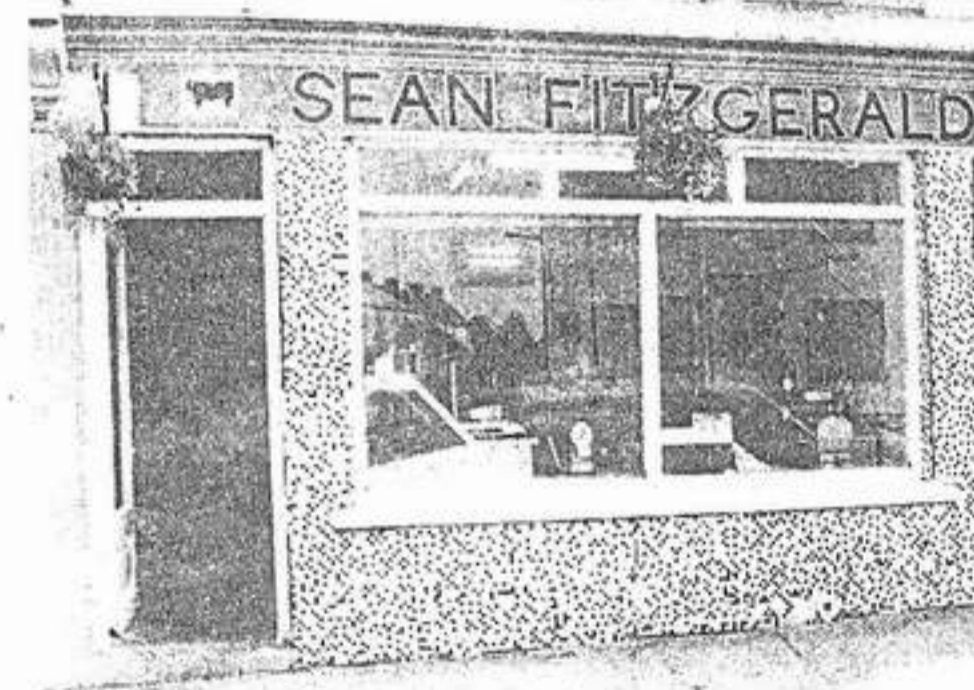
Fitzgerald's Butchers Shop, Ballylanders, offers an excellent selection of best quality meats.

lamb and pork to delicious farm fresh chickens and home made black puddings.