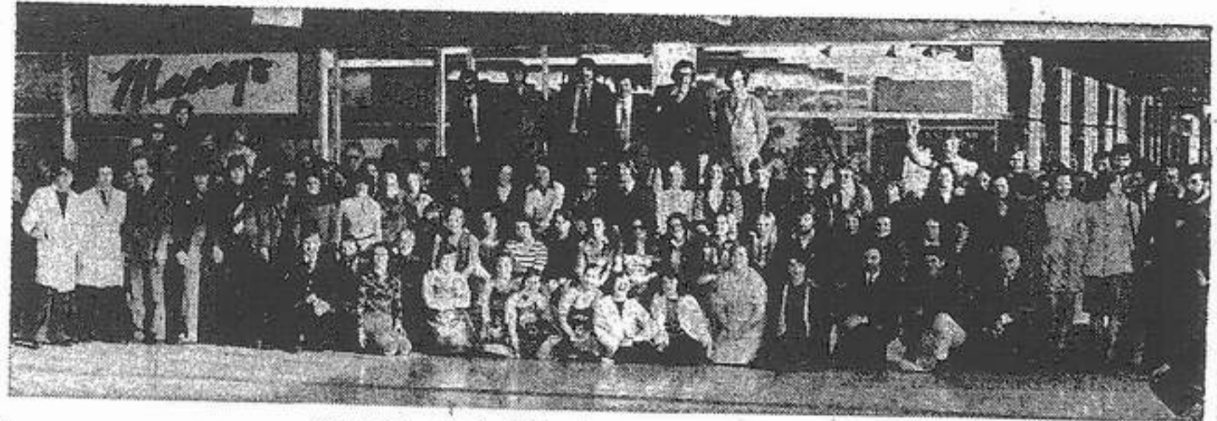
The happy staff of the Crescent Shopping Centre.

Free transport will also be provided to and from the shopping centre on Good Friday from the following areas at 2.45 p.m., returning same evening at 8 p.m.—Newcastle West, Charleville, Foynes, Ennis, Scariff and Tipperary Town.