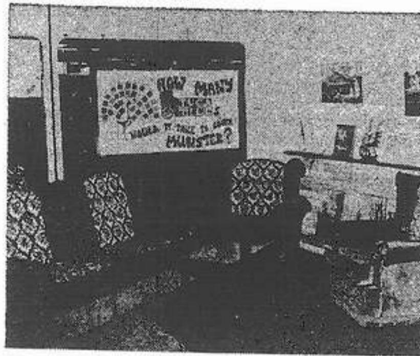
One of the many suites available at Keehans' Furniture and Carpet Store at the Crescent Shopping Centre.