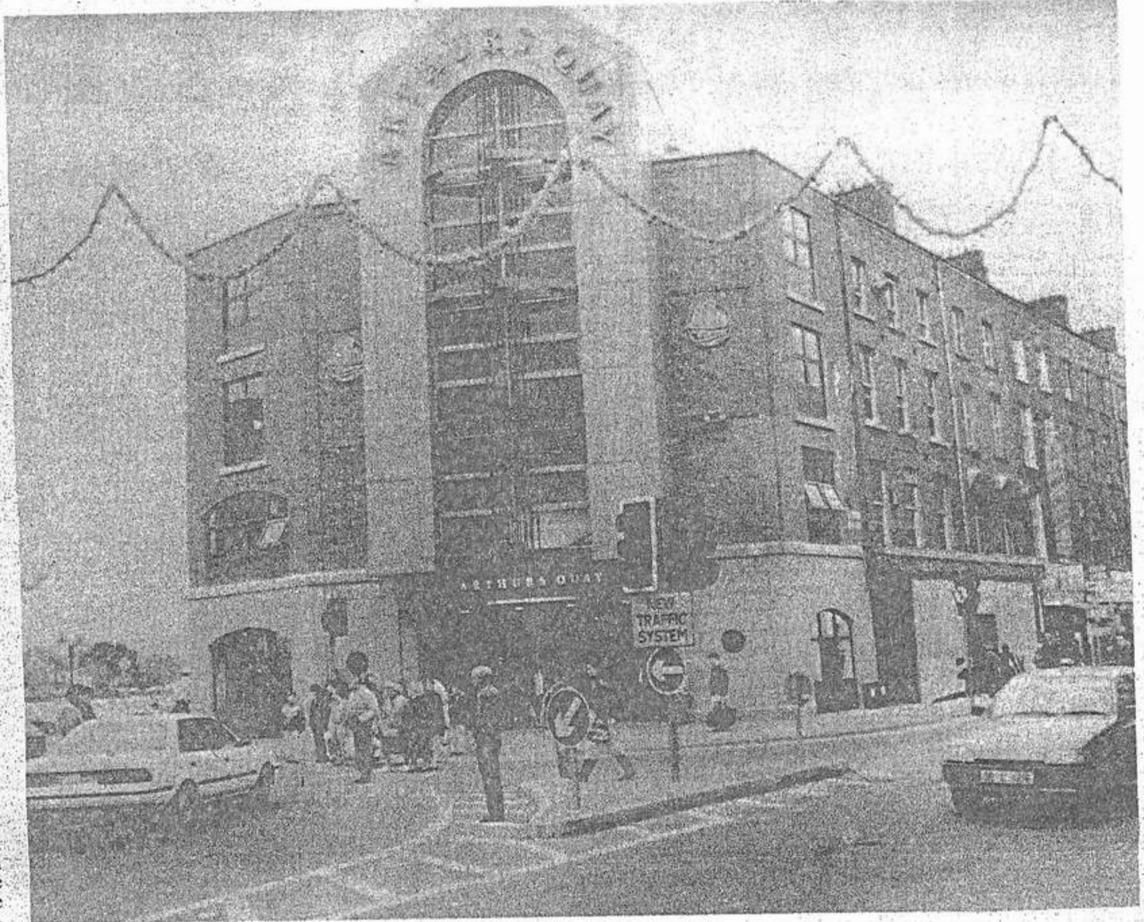
●The Arthurs Quay: Limerick's new shopping hub

Demolition work was finished in June last year, with the car park completed in February this year, apartments and offices in August, and finally the shopping mall