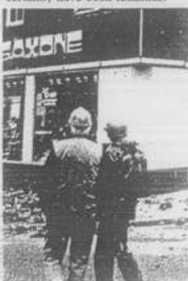
Workers prepare to demolish the building.