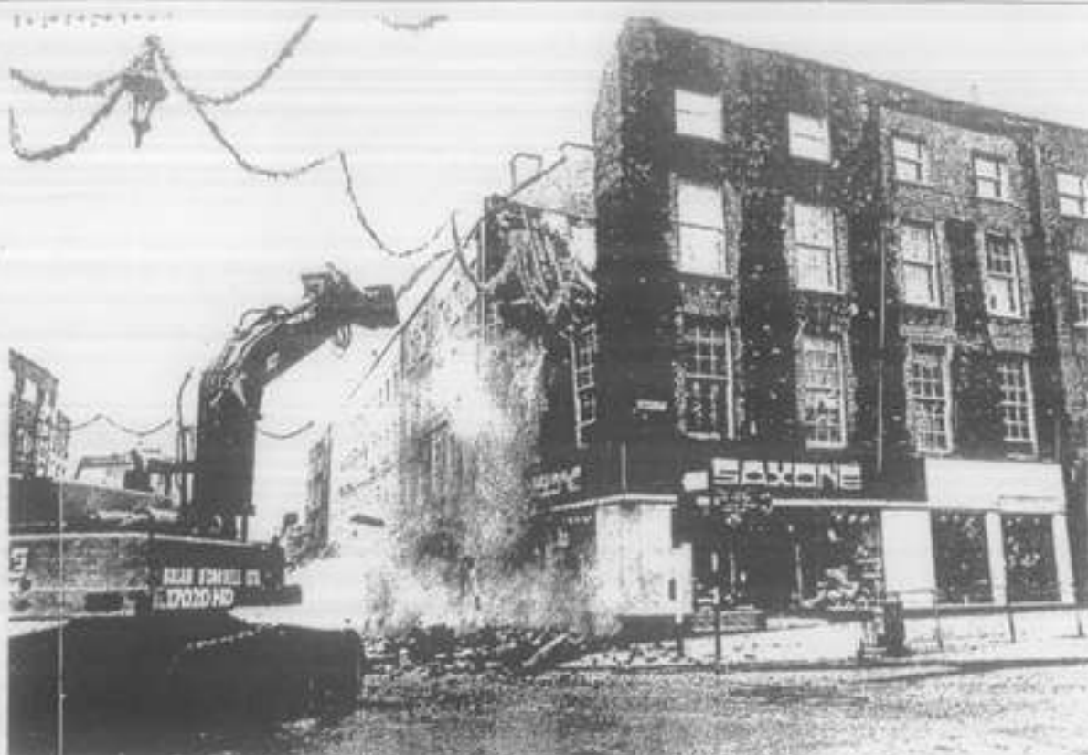
Demolishing the building this Friday afternoon.

Heavy traffic coming into the city centre from the Southside, such as Ballinacura, was diverted right at the junction of the main Ring Road.