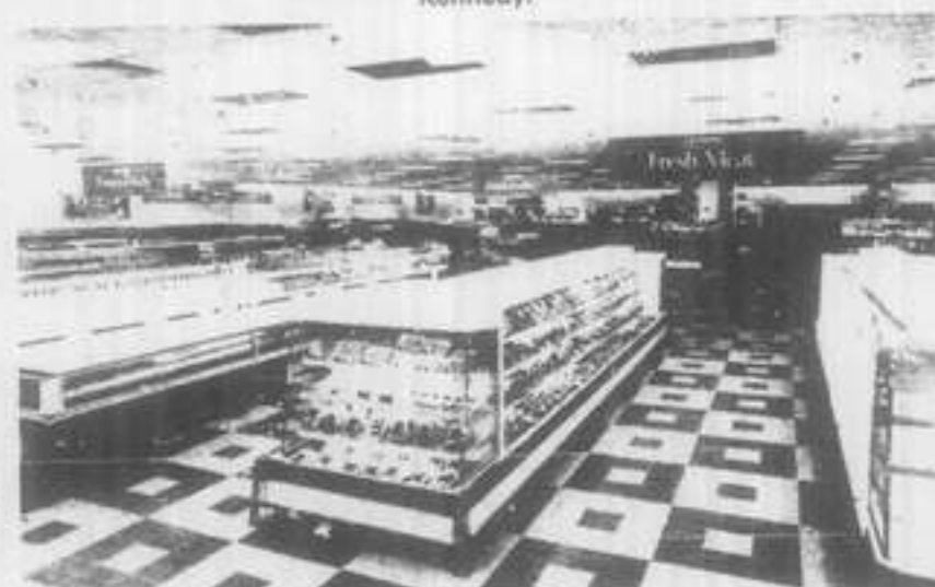
The Fresh Meat section of Dunnes of the Parkway.