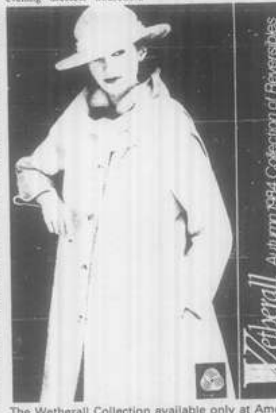
The Wetherall Collection available only at Amees, Cecil Street and Parkway Shopping Centre. Coat and Scarf £149.50. Hat £29.00.

Progress Cleaners Ltd. are dry cleaning and re-texturing specialists in silk, wedding and evening dresses, household