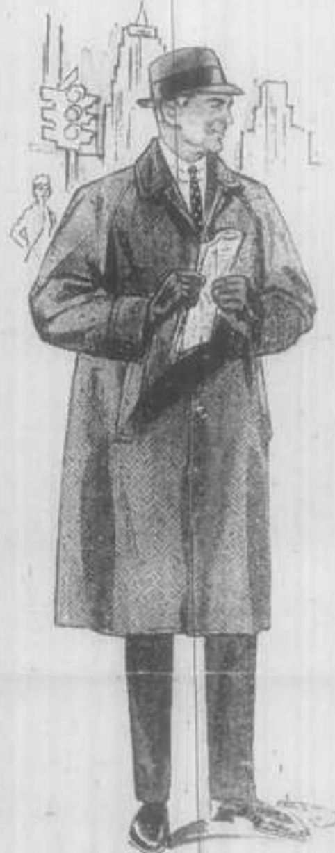
A WEARTEX overcoat

"And there's a 10 per cent. discount on all articles purchased during the coming week—and, Provisional Checks are also welcome. Lastly, we are a Prize Scheme Shop."