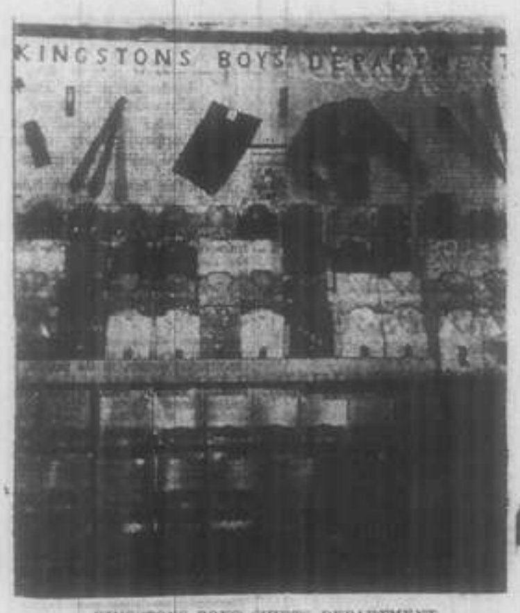
KINGSTONS BOYS' SHIRTS DEPARTMENT.