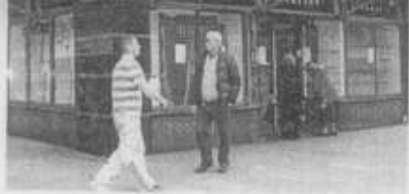
Ferguson's chemist on O'Connell Street, which ceased trading last Saturday

group, declined to comment this Tuesday. A creditors meeting is known to have taken place on Monday afternoon.