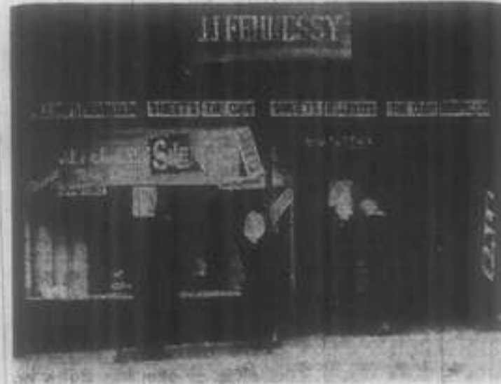
Passersby watching the bargains being placed in the windows.

The exterior of the spacious premises will remain the same for the moment, but the window will contain a larger variety of goods at prices which have to be seen to be believed.