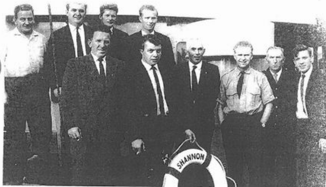
Pictured aboard the Shannon which completed its maiden voyage in Limerick on September 21, 1964.