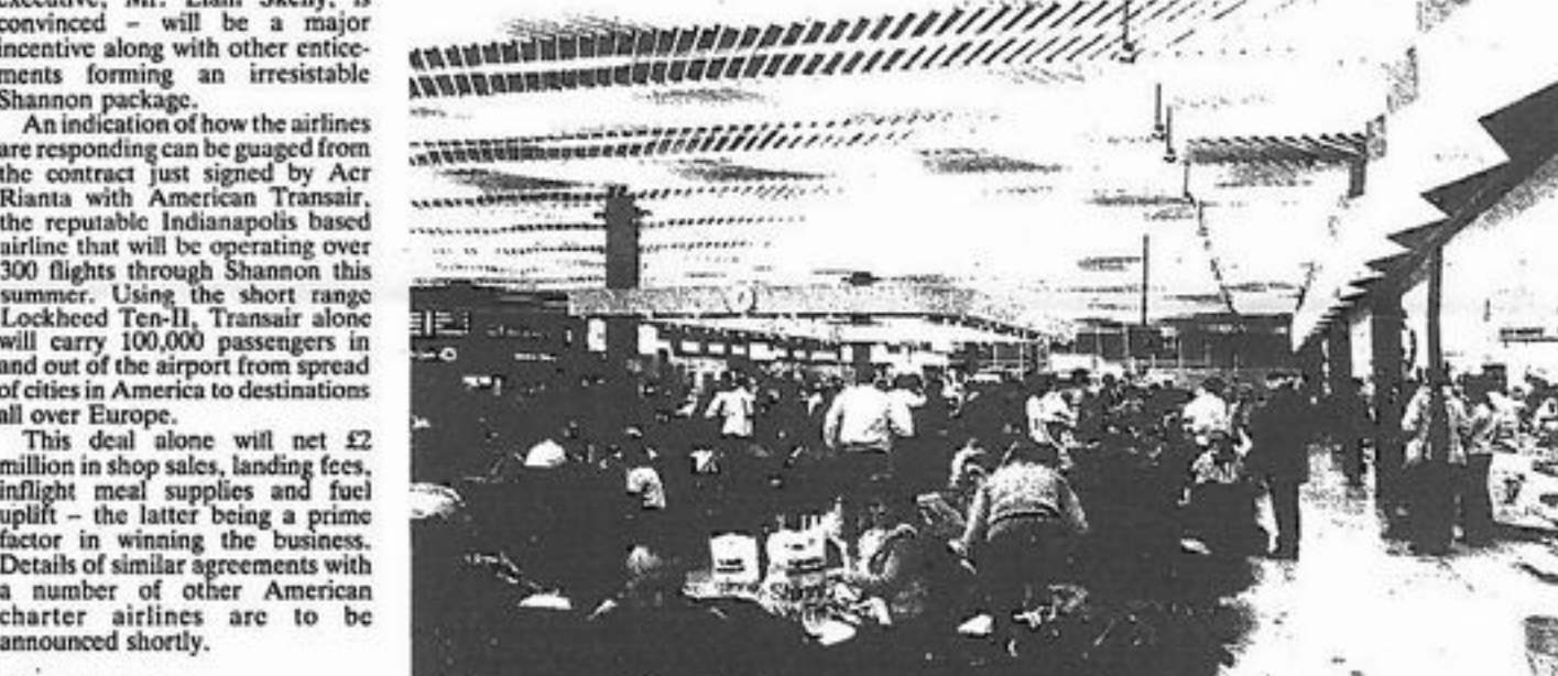
Relaxing amid the bustle.

THE SHANNON shops turned over £11,877,951.00 in 1984, an increase of 37% on the previous year. Catering activities, always a loss maker because of concessions to staff, broke even at £5,014,541. Tours and banquets up 23% returned £3,697,000 while Mail Order sales reached £9,819,847 an 18% increase on 1983. Revenue from landing and parking fees amounted to £4,276,639 a 25% improvement. Passenger load fees reached £2,179,499, up 19%, while rents and concessions netted £2,490,322. THE AER RIANATA boom contributed significantly to the region's economy. The currency paid out some £11,690,280 in wages and related costs. There were further gains to the region in payment for material and services which totalled £2,460,000. MORE THAN one million passengers passed through Shannon in 1984, with a 23.6% improvement in the North America travel trade. European and U.K. passenger traffic declined, however — with a drop of 4.7% on the London route and Continental passenger numbers were slightly down, 0.7%. Gross passenger movements reached 1,090,752, up 10.1% on 1983. Terminal passenger figures improved by 9.7% to 632,603, while transit passengers climbed to 458,149 from 415,318 in 1983.