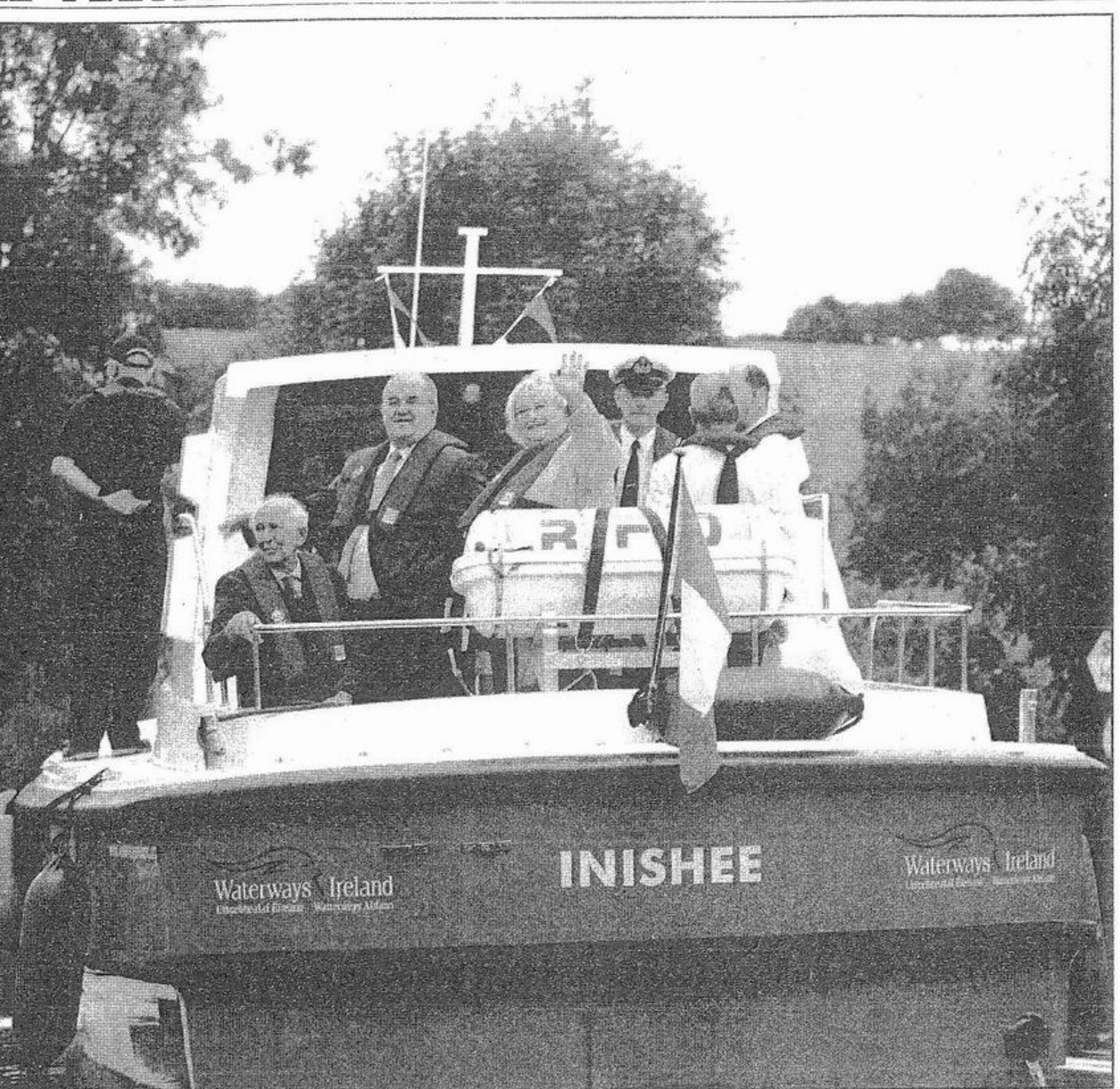
Minister of State at the Department of Education and Science, Sile de Valera, TD enjoying a boat trip off Scarriff Harbour to celebrate the opening of the new Waterways Ireland Regional Office in Scarriff.