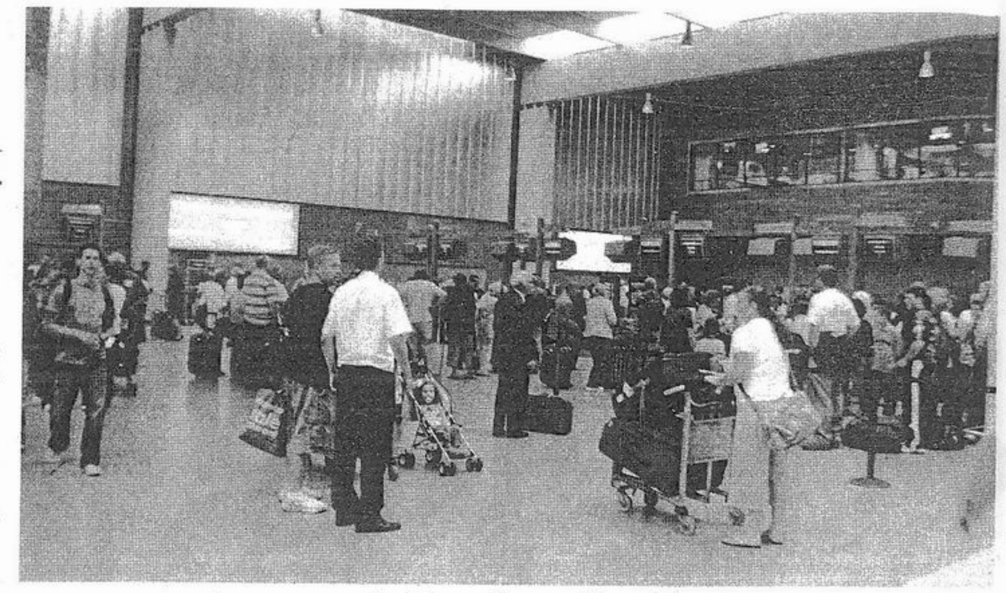
Busiest ever Shannon Airport

be accessible to all. "This is an exciting development which will be greatly beneficial to