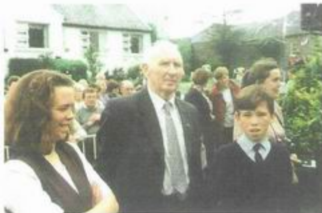
Mainchín in Bruree in 1993