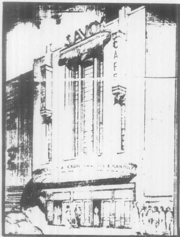
● An artist's impression of the facade of the Limerick Savoy in 1935.