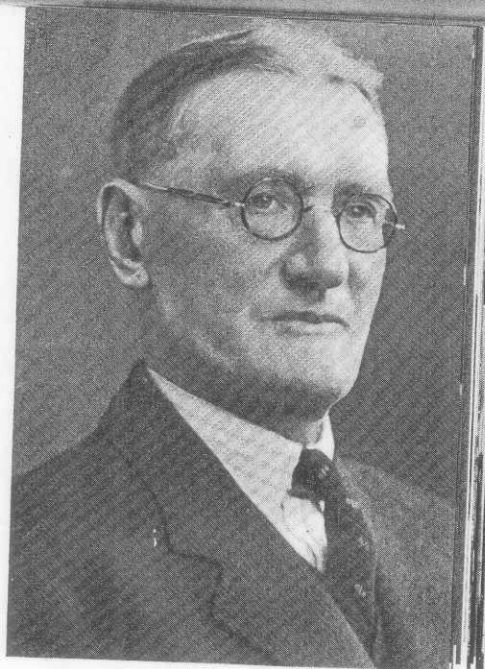
DR. RICHARD HAYES Lafayette