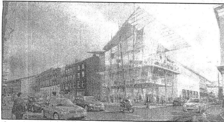
The new Opera Centre: has been given the green light with some conditions