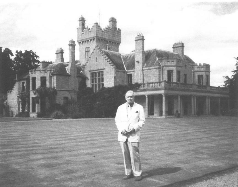
Glencairn House with author in foreground