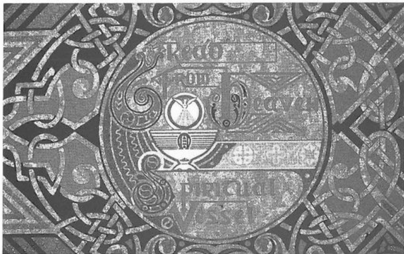
Depiction of the Bread from Heaven , from the Crypt floor of St Mary's Cathedral, Sydney

Hail, gentle scholar, Not farewell Thy vast bequest of knowledge Earns a salute More lasting than the rifles roll Over a hero's grave Hail humble priest, Remain with us Let thy example Of service to truth Light up the path of priests And scripturists As yet unborn.