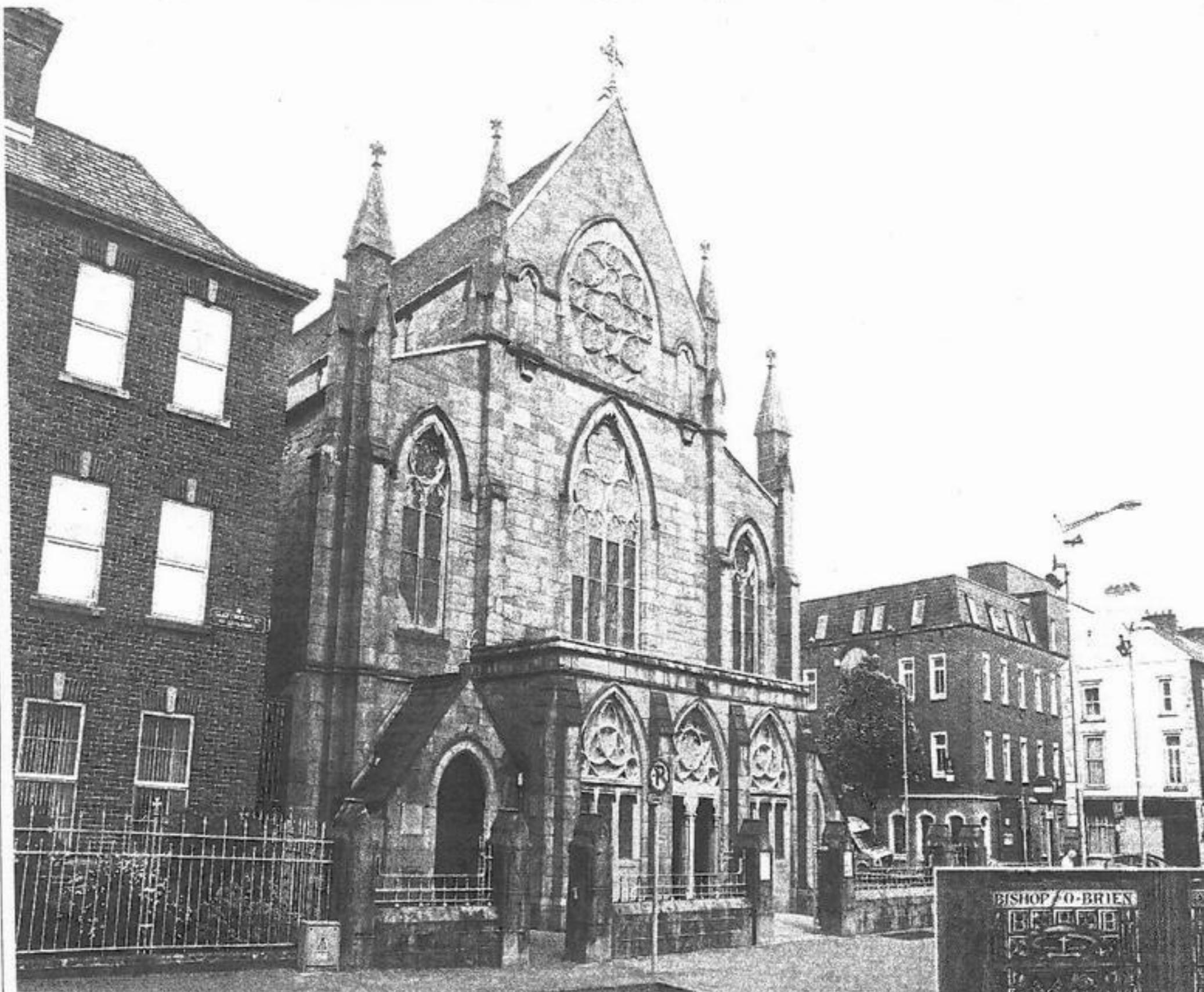
St Saviour's Dominican Church in Limerick

the Bishop was sentenced to death, he warned Ireton that he too would soon appear before the tribunal of God. Ireton died three weeks later,