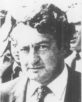
Mr. O'Malley: "My future is tied up in politics."

party, Mr. O'Malley said it was a case of concern to a lot of people in Fianna Fail that it was not narrowly ahead of the Coalition at a time like this, when it should appear to be a long, long way ahead.