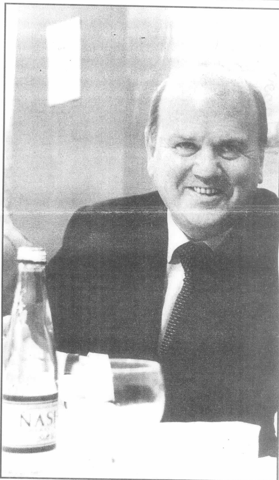
Michael Noonan, happy after his victory last evening.