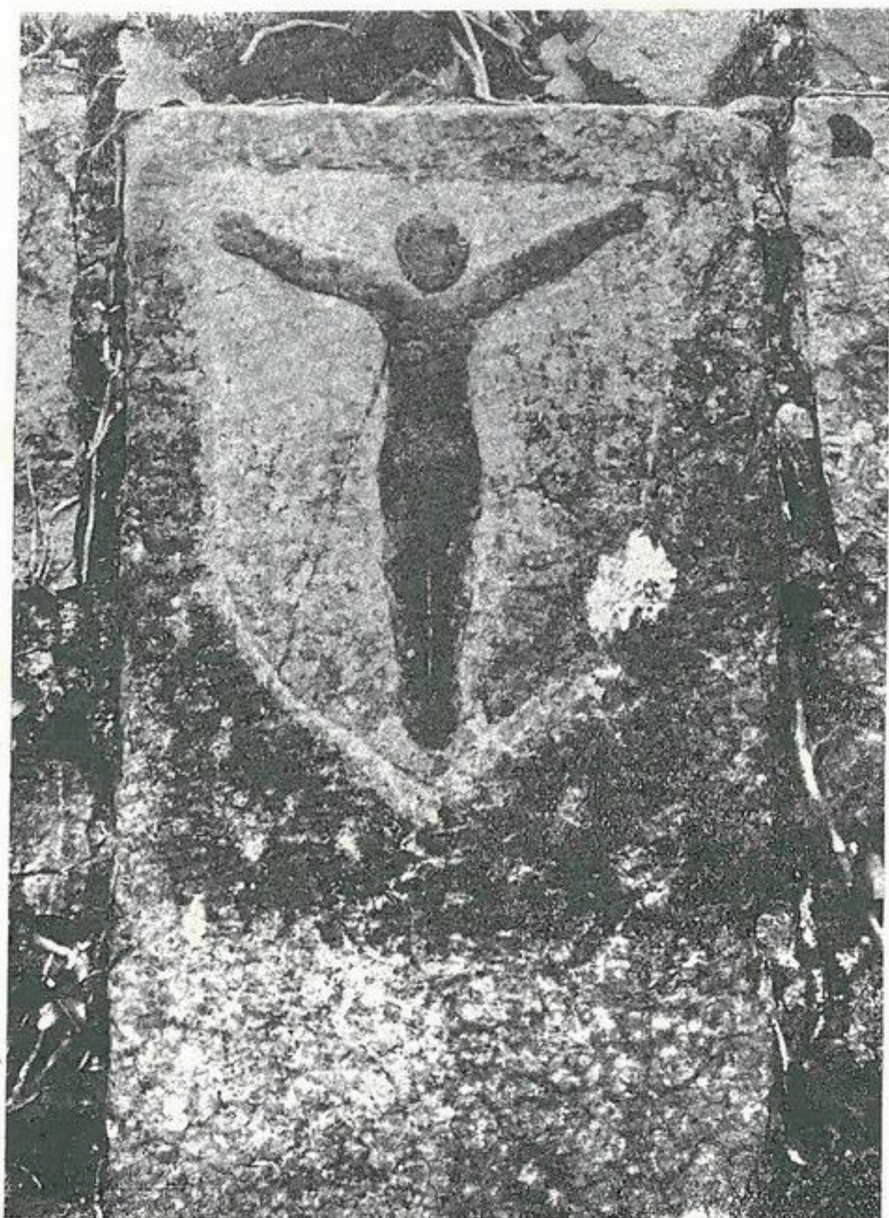
CROSS AT LUDDEN PARISH BURIAL GROUND.