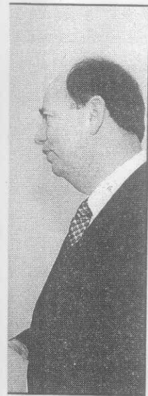
almost 5,000 by

literary from ere to reach the reland final ast Offaly, icing Clare in the ster Final. am becomes a