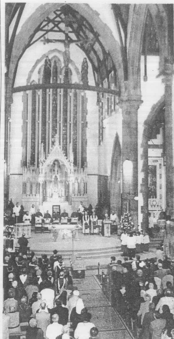
At the obsequies.