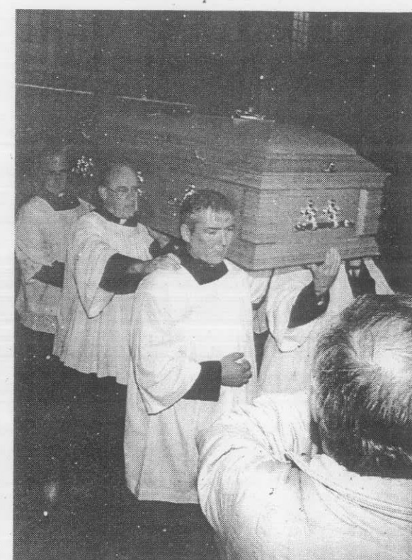
Arrival at the Cathedral.