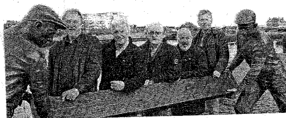
Granny's Intentions at the dockers monument