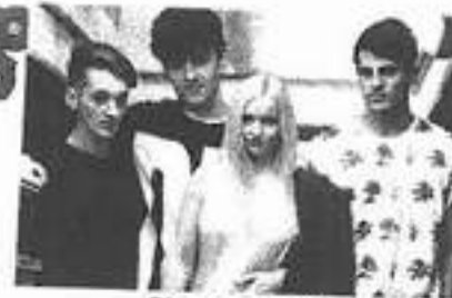
Clean Bandit at No.1